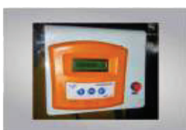
Digital Water Meter