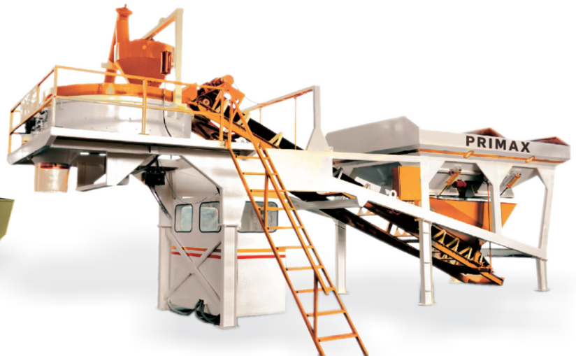
COMPACT CONCRETE BATCHING PLANT