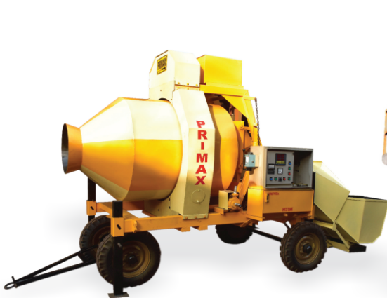
MINI MOBILE BATCHING PLANT (REVERSIBLE MIXER)