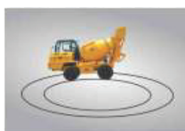
Turning Radius 3 Merers