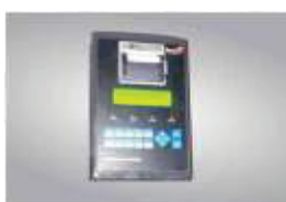
Batch Counter with Printer